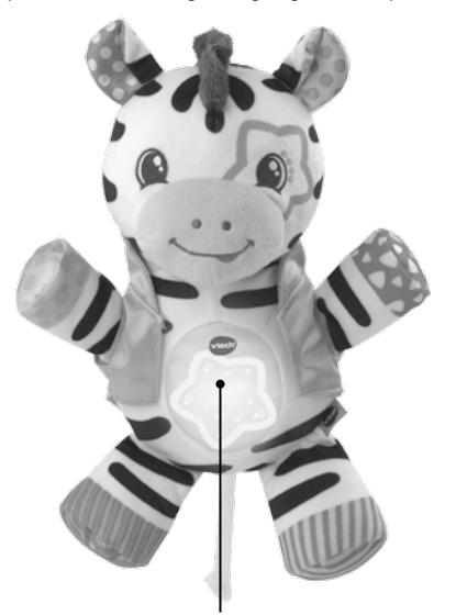
Light Up Tummy Button

Meet the funky Lights and Stripes Zebra by VTech®! This cute soft fabric zebra has lots of style and could just be the coolest zebra! Zebra's silky fabrics provide comforting tactile stimulation and will also visually stimulate your little one. Crinkly paper hooves and ears have different colourful patterns and encourage tactile stimulation. When you press the colour changing light up button on Zebra's tummy he will play exciting music, cool songs and fun phrases which support and encourage language development.